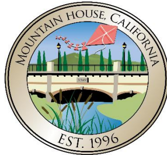
EXHIBIT A SCOPE OF SERVICES