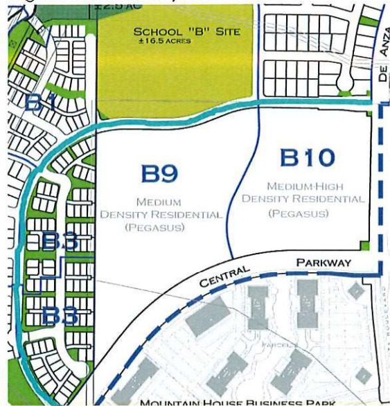
Figure 1: Original Location of Collector Street

Before conducting an assessment, AMG will work with MH to determine the exact realignment of the proposed reduced collector street. The original alignment of the collector street that hug the southern boundary of the school site is shown in Figure 1 .